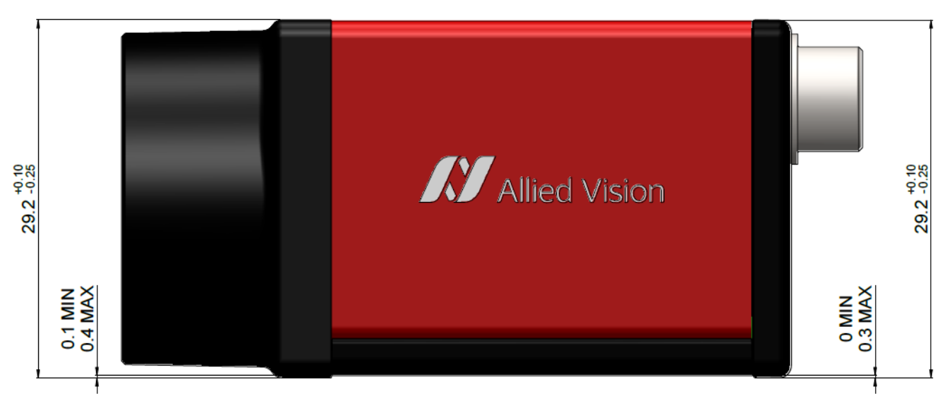
Figure 2 – Front flange and back plate vs. bottom plate: housings with legacy silver nickel plating vs. new black powder coating