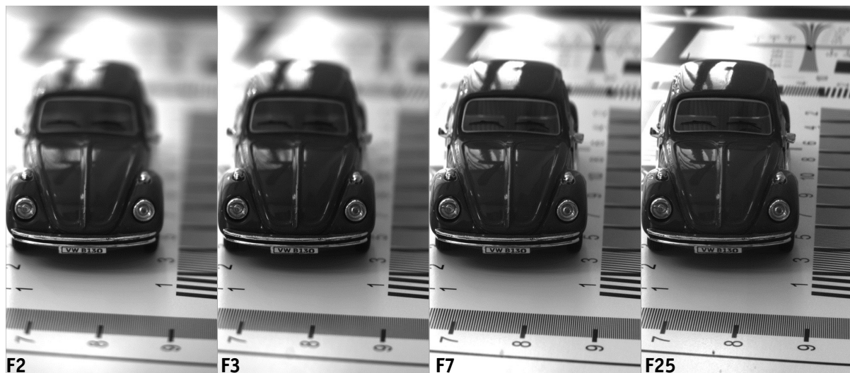
Figure 1: Depth of field comparison across changing F-number

Capturing a focused and balanced image is critical for any imaging system. When working distances vary, maximizing the depth of field is often desirable. Depth of field defines a measure of distance in which the object remains in focus. Figure 1 demonstrates the impact of changing camera F-number on the depth of field. Notice the image on the far left, F2.0 shows a blurry image behind and in front of the model car license plate. As the F-number is increased and the iris is closed, depth of field increases until in the far right image F25, most of the model car is in focus. This means the depth of field has been increased. This focusing depth can now be optimized for different scenarios using P-iris lens control.